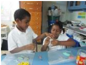
Some of our QCS sculptors are quite creative!!

Mix the first four ingredients. Add food coloring to the water. Gradually add small amounts of water until mixture attains the consistency of bread dough. You may not use the entire amount of water. Store in an airtight container or plastic bag. It lasts a long time!